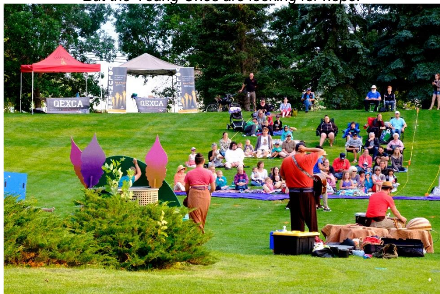
Theatre in the Park 2017

"The earth is in a terrible way. The sun is too hot. The land is too dry. But the Young Ones are looking for hope."